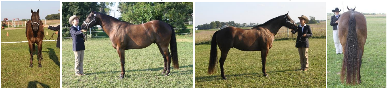
Photo examples. 2018 World Champion Gelding – R Dark Chocolate Kisses, owned by Pat Riehl